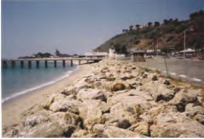
Stability Analysis of a Revetment Located East of Malibu Pier, California