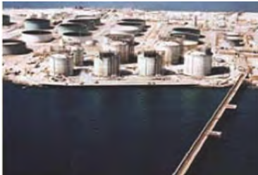
Assessment of Design Parameters for Proposed Seawater Circulation Systems and LNG Jetty at Das Island- Abu Dhabi