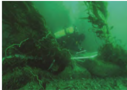
Engineering and Construction of Wheeler North Reef- San Clemente, CA