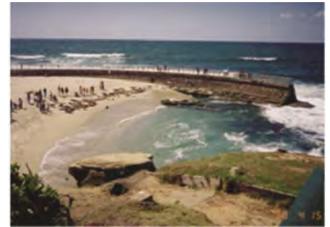
La Jolla Children's Pool Beach Management and Water Quality improvement- La-Jolla, California