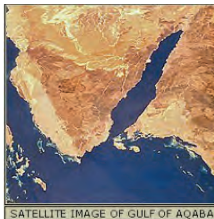
Gulf of Aqaba Environmental Data Survey- Middle East