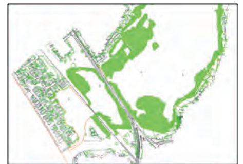
Land and Water Management Planning, Buena Vista Lagoon San Diego County, California