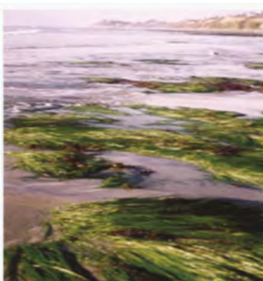
Observation of the Status of Biological and Physical Intertidal- Caulerpa/Eelgrass Survey at San Dieguito Lagoon- Del Mar, CA Encinitas, California