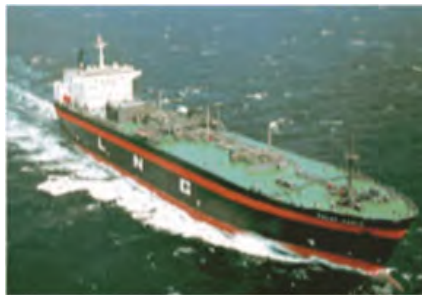
Harbor Monitoring Program for the Egyptian LNG- Alexandria, Egypt